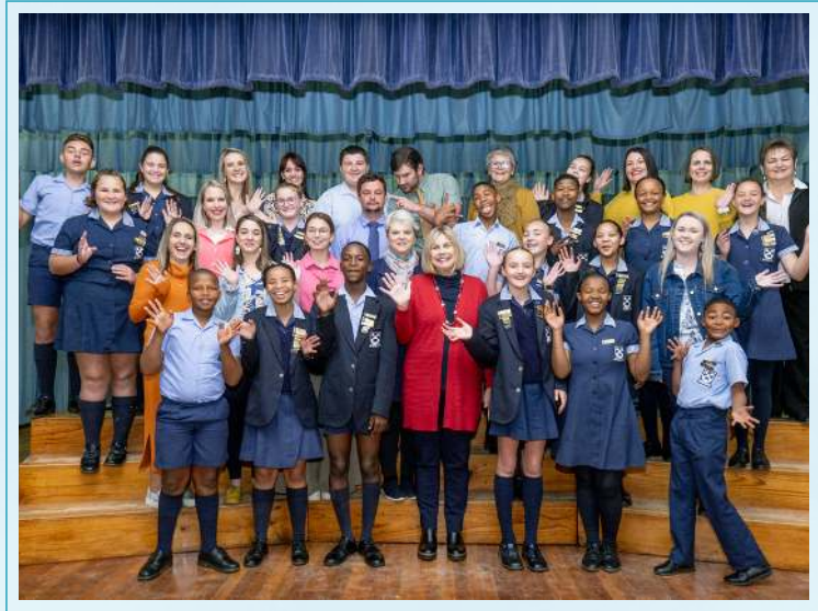
Grade 7 and Staff