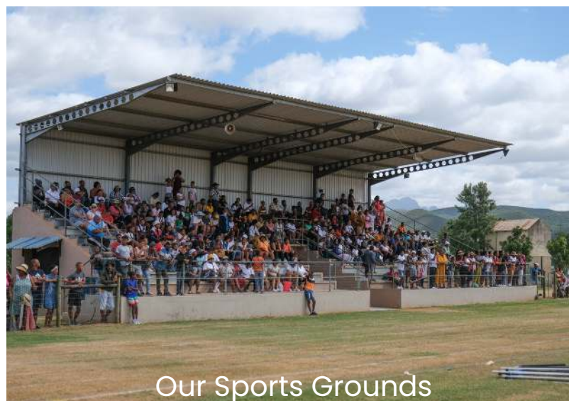
Our Sports Grounds