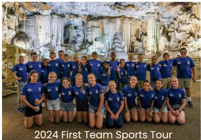
2024 First Team Sports Tour